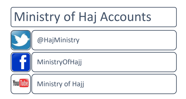
Figure 1.2 Ministry of Haj's Accounts on Social Media.

To keep up with new trends, companies and governments need a presence on social media. To facilitate communication with pilgrims and the companies sponsoring the pilgrimage services, the studyer has found that the Ministry of Haj and other sectors concerned with pilgrims have accounts on social media, including Twitter, Facebook, and YouTube, as seen in Figure 1.2.